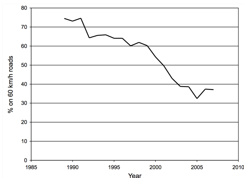
Figure 3: Pedestrian fatalities: Annual percentage on 60 km/h roads in Australia 1989 to 2007

Based on this incomplete information, the assumption is made here that 75 percent of pedestrian fatalities in Australia occurred on 60 km/h roads from 1975 to 1988. For the remainder of the period of interest there is accurate information, as shown in Figure 3. These two sources of information yield an estimate of 9,194 pedestrians fatally injured on 60 km/h roads in Australia from 1975 to 2007, inclusive. Taking the figure of a 30 percent reduction in pedestrian fatalities had the chosen limit been 50 km/h, the choice of 60 km/h for the urban area speed limit has resulted in the deaths of 2,758 pedestrians in Australia since 1974.